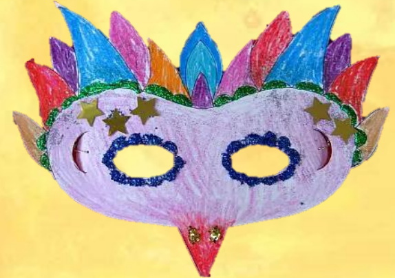
Make your own Mardi Gras Mask